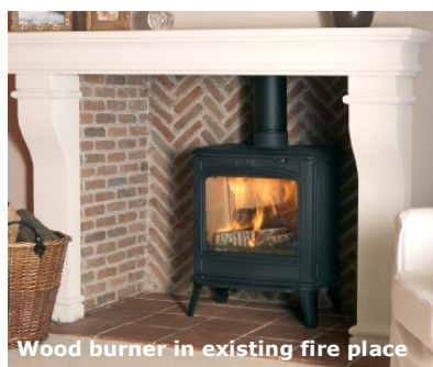
Wood burner in existing fire place