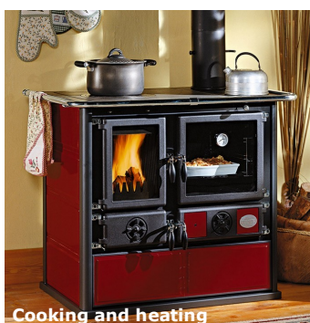
Cooking and heating

Depending on the size of the stove installed and the layout of the home a single appliance can be used to heat one or more rooms. Some models can be used to supplement the hot water and some can also be used for cooking.